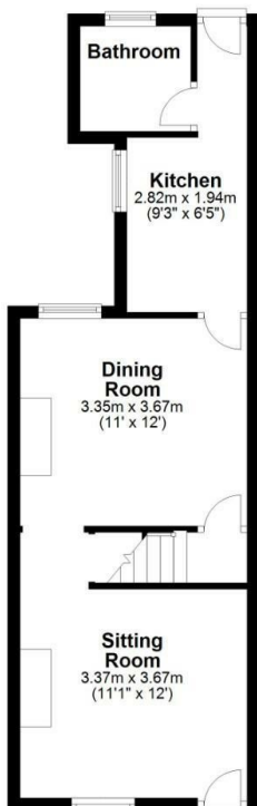
Ground Floor Approx. 38.8 sq. metres (417.8 sq. feet)